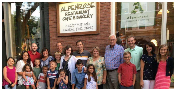
Celebrating Kate's mom's birthday with all the brothers & kids

https://usgiving.aimint.org/missionary/1024350